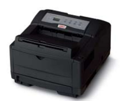
B4600 Digital Monochrome Printer